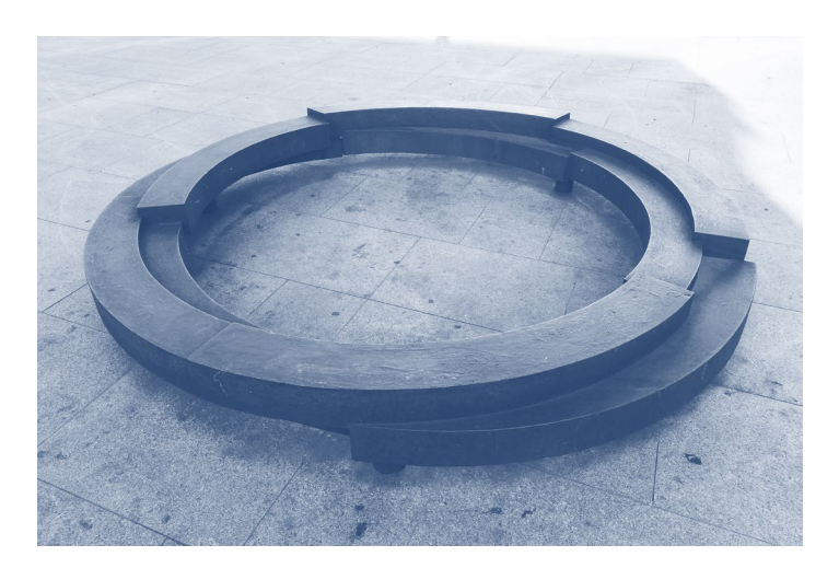
The Wheel of the Roma, Memorial to the Victims of the Holocaust - Bucharest, Romania.