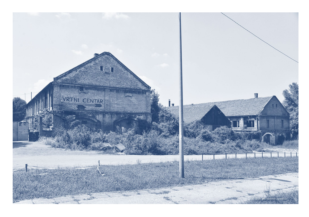
Topovske Šupe concentration camp, Belgrade, Serbia.

While Serbian Roma were interned and/or killed in concentration camps like Crveni Krst, Sajmište, Belgrade Fair Grounds, or Topovske Šupe, mass shootings of Roma took place in several other Serbian cities, such as Kragujevac, Šabac, Kruševac, Leskovac, and Niš. Roma also died in the October 1941 killings in Kragujevac and during the 1942 Novi Sad raid.<sup>153</sup>